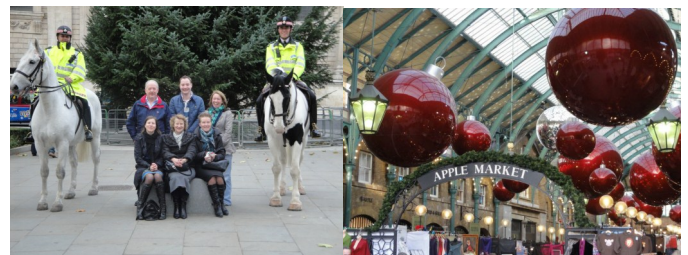
With our Police Escort