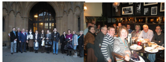
TUV enter Westminster Hall

The Finance Committee will be deciding on next years destination in February and any Party members with suggestions should contact their branch finance representative in advance of our February meeting.