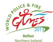
World Police and Fire Games: No Union flag or Anthems allowed to represent athletes.

"People need to make their voices heard before it is too late."