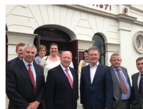
Jim Allister MLA attending the "Raze the Maze" Rally at Lisburn Orange Hall.

"Sinn Fein have deliberately targeted certain parades in an attempt to make them contentious. This strategy continues as we see the Parades Commission's willingness to reward violence in North Belfast by banning parades. "