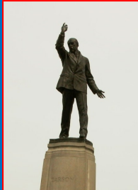
Conor Murphy practiced religious discrimination as DRD Minister

Jim Allister MLA has uncovered further evidence of religious discrimination at the heart of government.